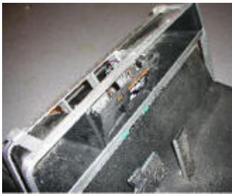
Step 4: Loosen the dash and tilt it back to allow easier clearance for the wiring on the new column