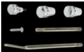
Step 7: Install your knobs and handles as shown on the back of the dress-up kit