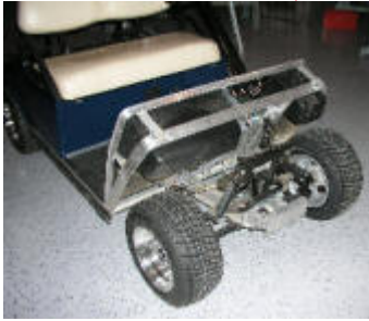
Step 1: Remove the Front Cowl

(1992 To Present Club Car Installation Shown)