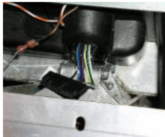
Step 5: Slide the column into the lower column support. Wires should exit the column at 12 o'clock.