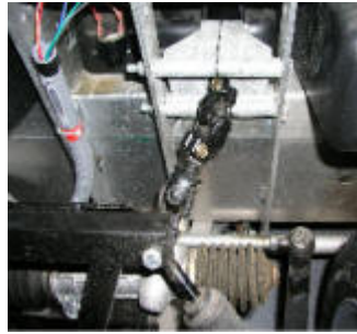
Step 2: Remove the Upper U-Joint Bolt